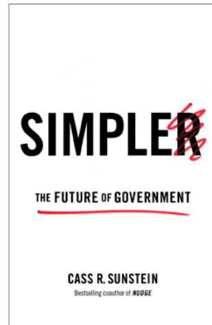
SIMPLER: THE FUTURE OF GOVERNMENT BY CASS R. SUNSTEIN